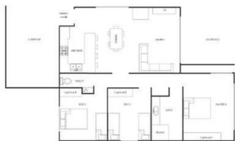
Kudetah & Shangri La