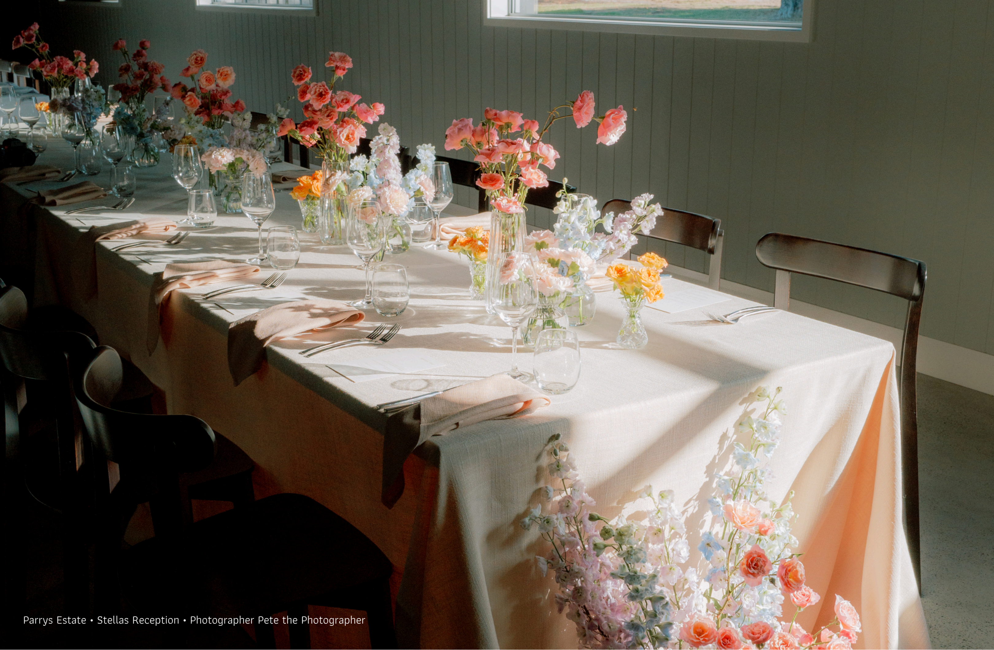
Parrys Estate • Stellas Reception • Photographer Pete the Photographer