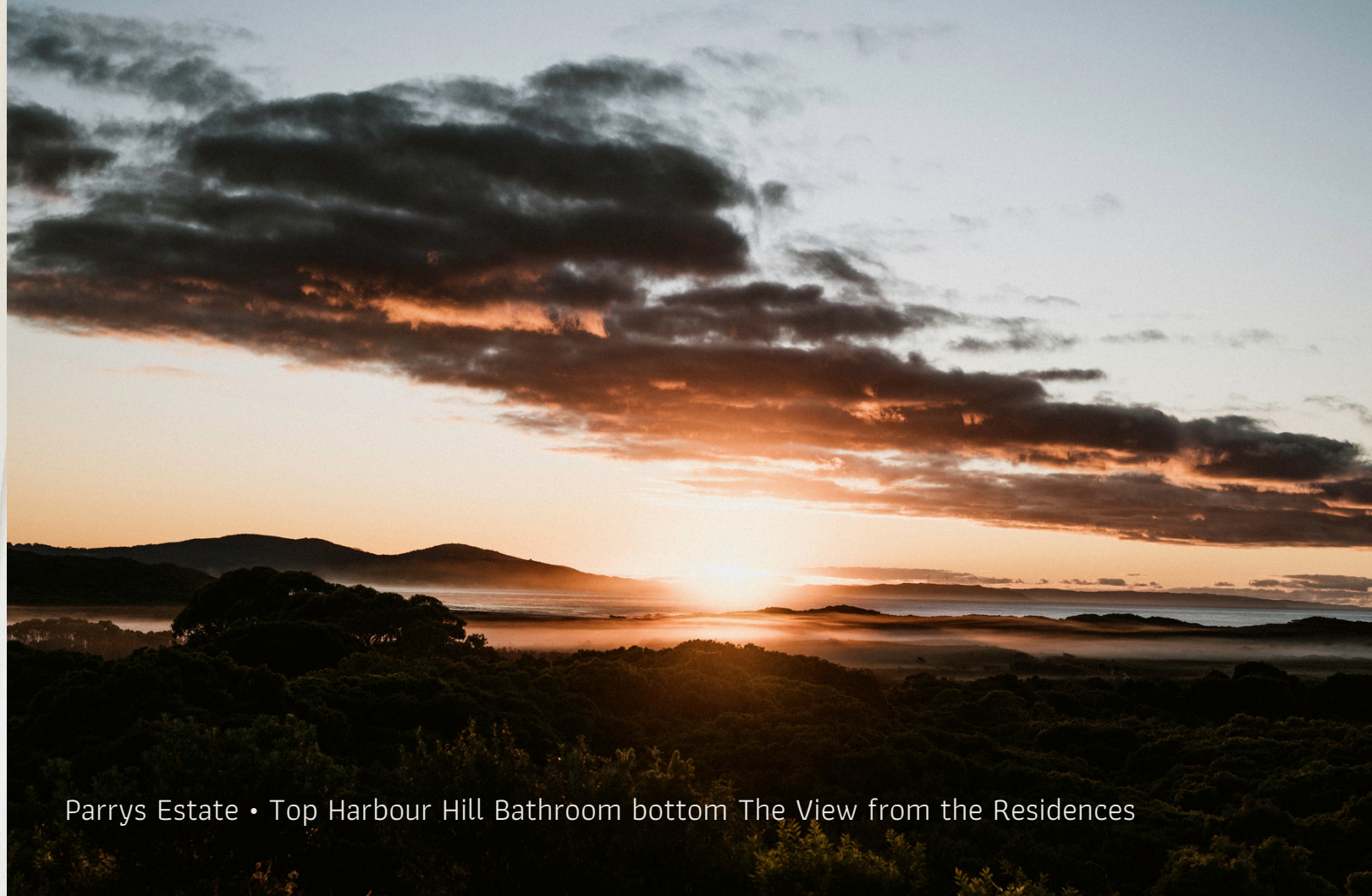
Parrys Estate • Top Lands End bottom Harbour Hill