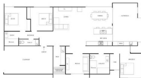
Harbour Hill & Lands End