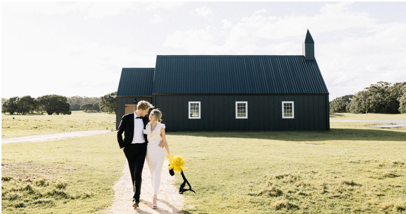
Parrys Estate • The Shelter •

When time for the reception, Stella's allows guests to gather in anticipation of the giant jarrah stable doors being rolled back to reveal the Dining Room in spectacular style.