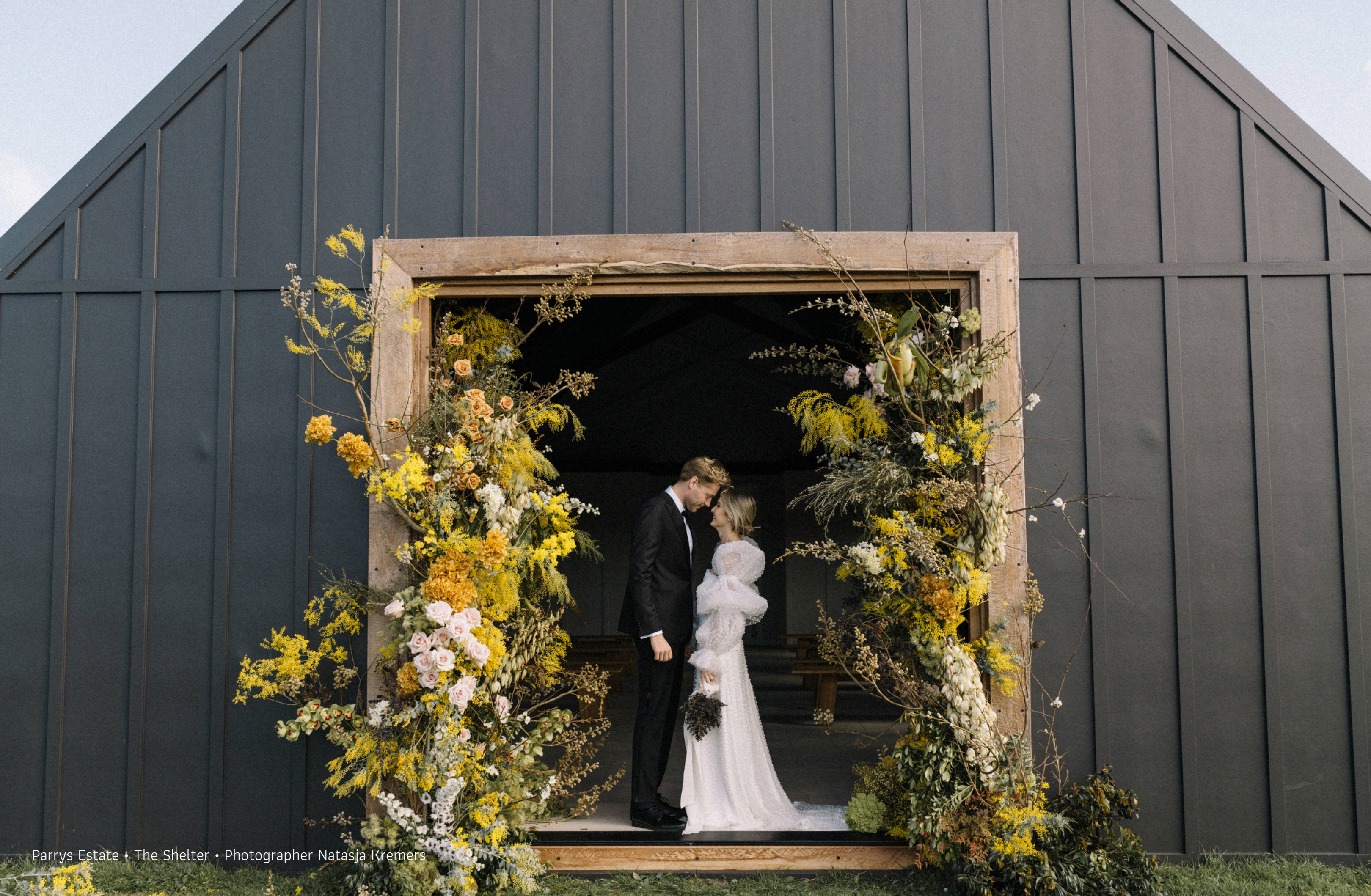
Parrys Estate • The Shelter