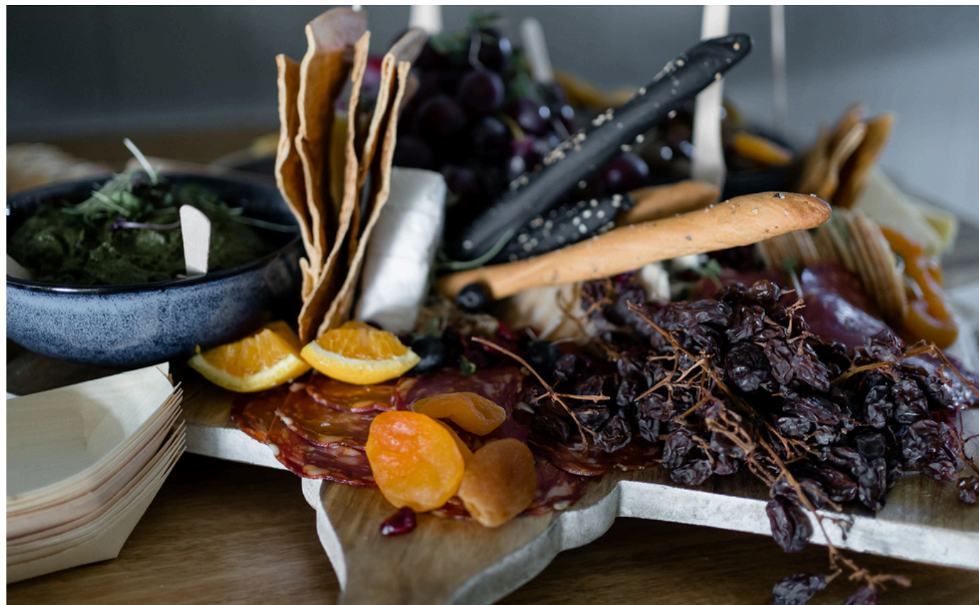
Parrys Estate • The Estate Kitchen

Please see the Parrys Estate Chefs document for more details.