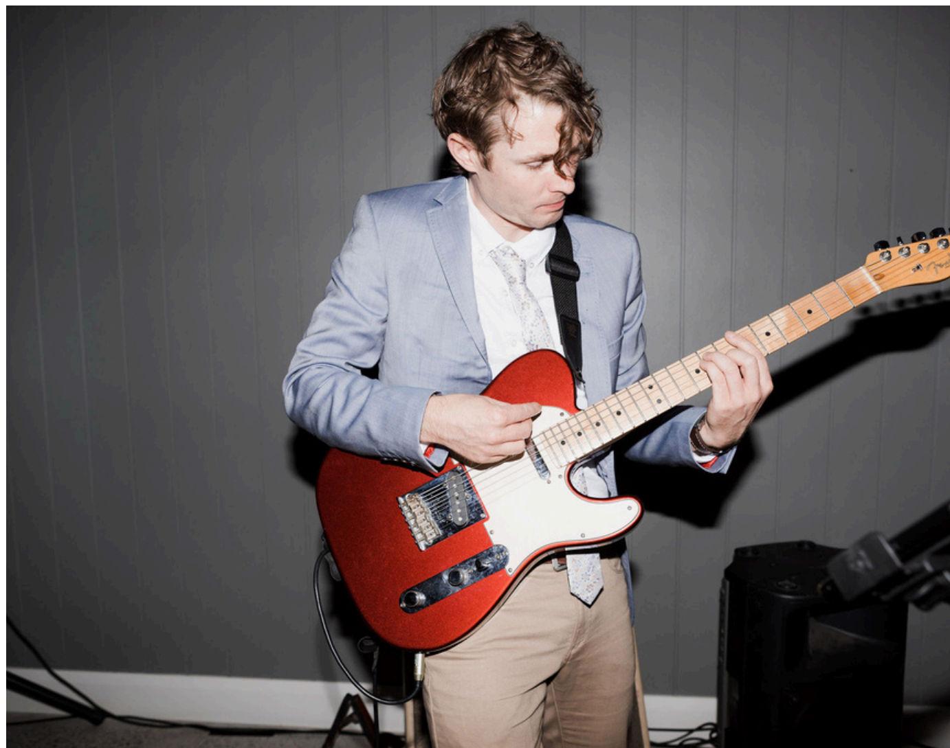
Parrys Estate • The party and after party • Photographer Holii and Ash

Both Stella's Reception and The Grounds provide ideal venues for your after party, allowing you and your guests to celebrate until your hearts' content - perhaps followed by an early morning wild swim!